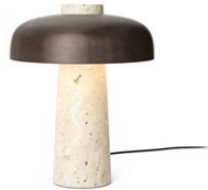
Table lamp with conical travertine base and bronzed anodised aluminium shade. A dimmer switch fitted on top of the lamp controls the dim to warm LED light. The Reverse Table Lamp is sold included five interchangeable plugs suitable for North America, Australia, China, Europe and the UK.