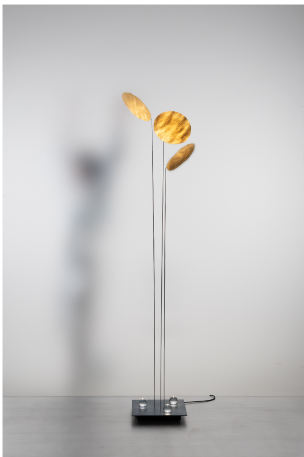
nuunu FLAVIA THUMSHIRN 2023